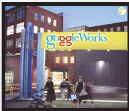
GoggleWorks Center for the Arts

Mountain Sanctuary; the original Daniel Boone homestead; and the nation’s third-largest jazz festival, Berks Jazz Fest. It’s a community rich with diverse cultural activities, including a symphony orchestra, professional sports teams (such as the Reading Phillies, which officially dubbed the city “Baseballtown,” and the Reading Royals ice hockey team), Sovereign Performing Arts Center, great museums, restaurants, unique tours, world-class entertainment, world-renowned festivals and more.