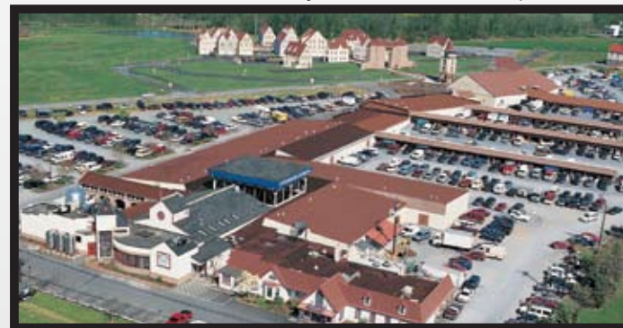
Stoudt's Brewery Restaurant Pub and shops

Adamstown is known as the antique capitol of the U.S. Located on Rt. 272, N. Reading Rd. "Stoudt's Brewery" Restaurant Pub is surrounded by antiques and Stoudtburg Villages' unusual shops. Find unique items and friendly, personal service in a relaxed atmosphere filled with Old World ambiance and shopkeepers residing above their businesses. The entire family won't want to miss Oktoberfest to celebrate German heritage in Pennsylvania Dutch style – right in the Brewery Hall, every Sunday in October. Experience a true European tradition featuring "oompah" bands, authentic foods and great microbrews topped off by the fun of a pig roast marched through the Gemutlichkeit Bier Garden. 717.484.4387. Visit www.stoudtsbeer.com .