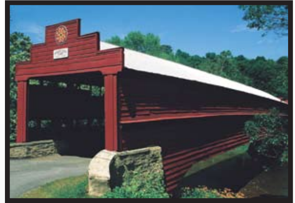
Berks County bridge

Daniel Boone was born and raised in Pennsylvania, just east of Reading on Nov. 2, 1734. The 579-acre Daniel Boone Homestead interprets the life of early English and German settlers in eastern Berks County, Pa. Visit the Boone House, blacksmith shop, barn, Bertolet log house and sawmill. The site includes seven 18th-century structures, a lake, picnic areas and other recreational facilities. A tour begins at the visitors center, which introduces the homestead through a variety of interesting exhibits leading to the Boone House. Admission. 500 Daniel Boone Rd., Birdsboro, Pa. 610.582.4900. www.danielboonehomestead.org .