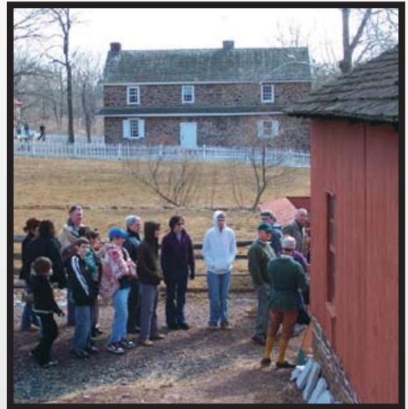
Daniel Boone Homestead