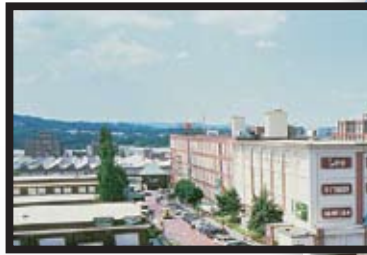
VF Outlet Village

Reading's VF Outlet Village is part of the oldest outlet mall in the United States and offers more than 90 name brand outlet stores and 75 retailers. More than 9.5 million visitors arrive yearly to enjoy America's real favorite pastime: shopping. The VF Village is a complex of old factory buildings converted into outlet stores with shopping as diverse as Liz Claiborne, Timberland and Dooney and Bourke Handbag outlet. The complex's centerpiece is the massive 175,000-square-foot VF Outlet store offering favorite brands such as Vanity Fair, Wrangler, Lee, Healthtex and Jansport. The VF Outlet Village features an on-site food court and adjacent restaurants, and those who need a respite from shopping can visit the info center and a museum with information on the shopping center. Located at Penn Avenue and Park Road in Reading. 800.772.8336. www.vffo.com .