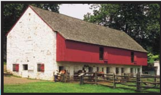
Hopewell Furnace Site